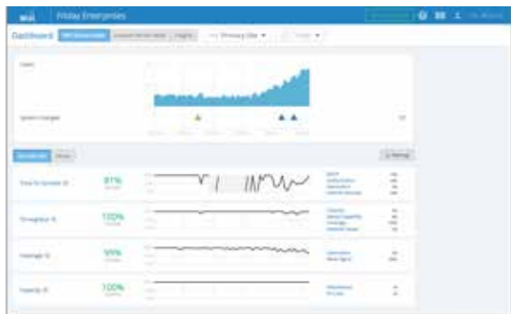
The AP21 collects data for the Mist cloud to use for Proactive Analytics and Event Correlation, as well as enforcing Service Level Expectations

A dedicated dual band radio collects data for Mist's patent-pending Proactive Analytics and Correlation Engine (PACE), which leverages machine learning to analyze user experience, correlate problems and automatically detect the root cause of problems. These metrics are used to monitor service level expectations and provide proactive recommendations to ensure problems don't occur (or are fixed as quickly as possible when they do).