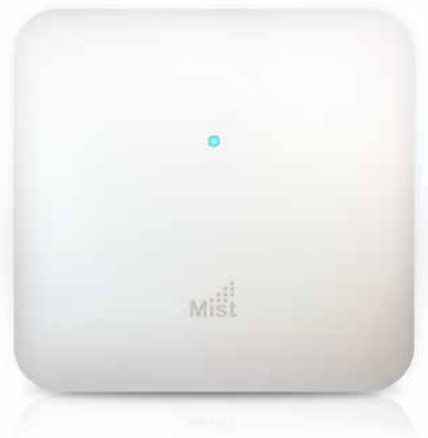
Mist Access Point AP21