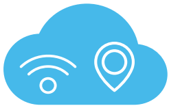
The Mist cloud