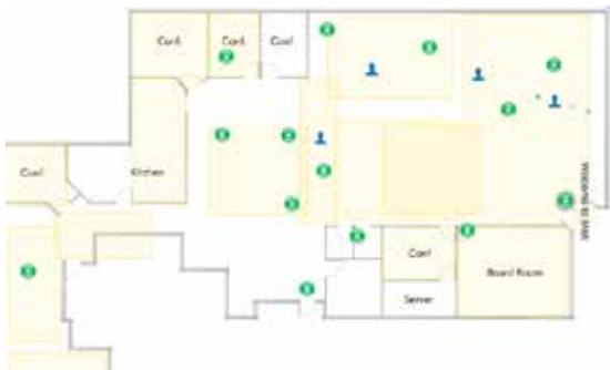
The AP21 works with the Mist cloud to provide high accuracy enterprise-grade Bluetooth® LE location services using virtual beacons

The AP21 delivers high performance 802.11ac Wave 2 wireless, with maximum throughput of up to 867 Mbps in the 5GHz band and up to 400 Mbps in the 2.4Ghz band.