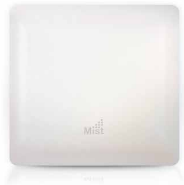
Mist AP61 Access Point